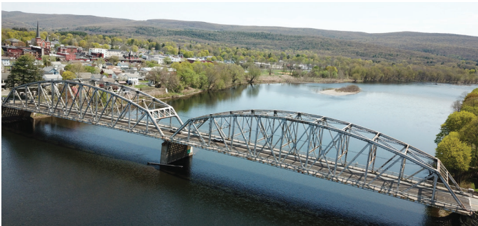
The State Route 6 over Delaware River Bridge in Pike County.