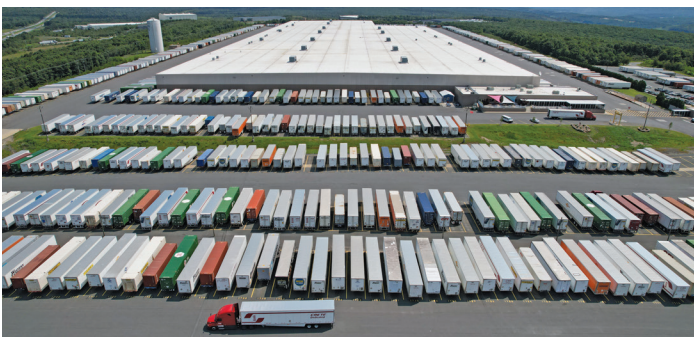
Lowe's Regional Distribution Center in the Schuylkill Highridge Business Park.

NEPA, in coordination with four other MPO planning areas, has secured $280,000 in supplemental planning funds for the development of the Eastern Pennsylvania Freight Plan. The regional freight plan will assist in coordinating all modes of freight travel for a 10-county region and identify development recommendations for accommodating our growing freight industry. The plan is expected to be complete by the end of 2023.