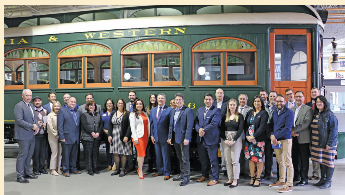
NEPA Alliance and MD Capital hosted a group of local business, economic development and municipal leaders at the Electric City Trolley Museum. Participants participated in a discussion about current topics affecting local business, community and economic development initiatives and various finance programs available to assist businesses navigate the ever changing economic environment.