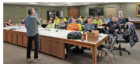
LTAP Winter Maintenance Class in Chestnuthill Township, Monroe County.