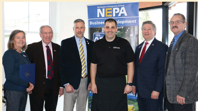
Constantino's Catering and Events Inc. opens Bailey's Cafe and Suites on Main in Dalton, Pa. NEPA Alliance assisted with financing through the Economic Development Administration (EDA) CARES ACT.