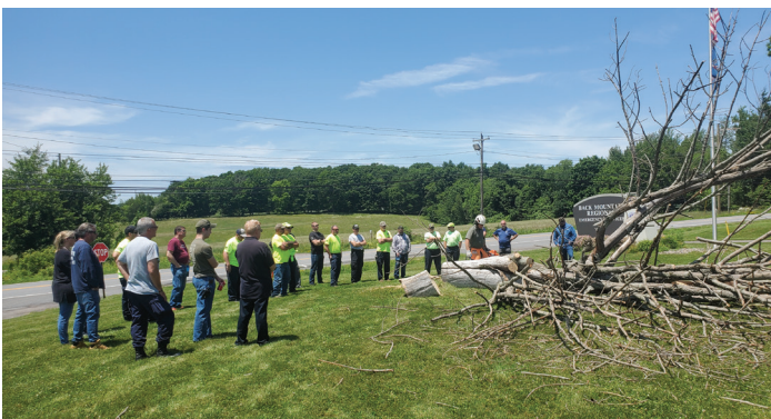
Participants at a LTAP chainsaw safety class.