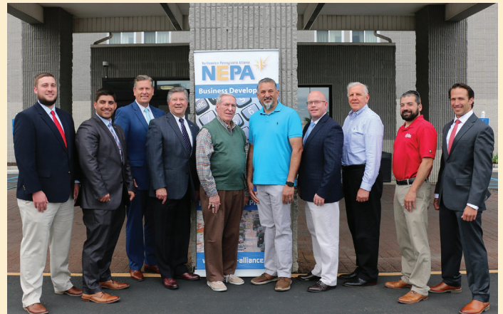
Dunmore Hospitality Group, Inc. received a SBA 504 loan for the refinance of commercial real estate and furniture, fixtures and equipment.