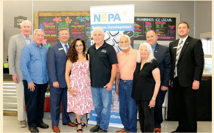
City Line receives loan to purchase furniture, fixtures and equipment for their dollar store location.