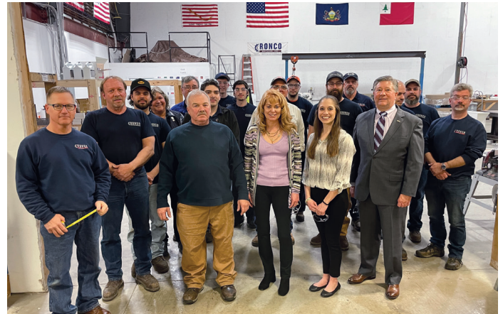
PA State Treasurer Stacy Garrity visited Ronco Machine to learn about the needs of area machine shops.